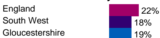
Chart 1. Proportion of workers on zero hours contracts by area

Less than a quarter (19%) of the workforce in Gloucestershire were on zero-hours contracts. Over half (58%) of the workforce usually worked full-time hours and 42% were part-time.